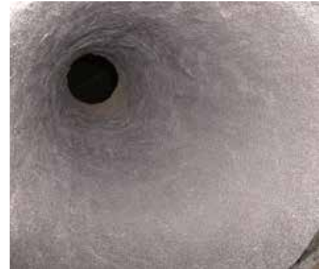
Steel cone coated in Belzona 1812

For more information, please contact your local Belzona representative: